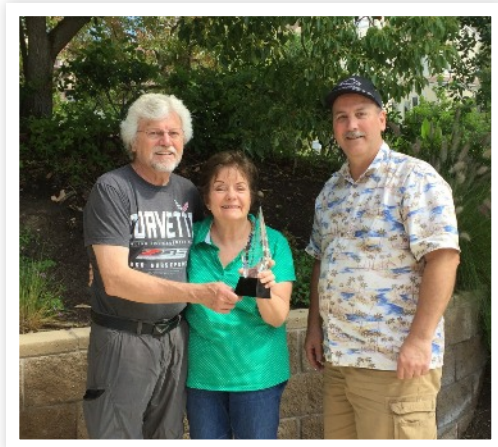
Club Participation, Simi Valley Corvettes